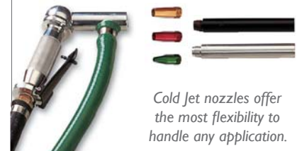
Cold Jet nozzles offer the most flexibility to handle any application.

Cold Jet nozzles are designed to deliver exceptional performance whatever the application.