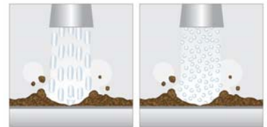
While pellets are most suitable when removing heavy, thick contaminants, shaved ice is ideal for cleaning thin hard contaminants, delicate substrates, intricate geometries or tiny openings.